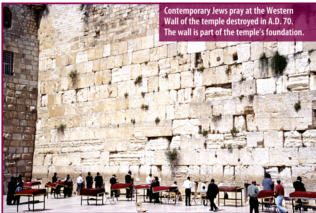
Contemporary Jews pray at the Western Wall of the temple destroyed in A.D. 70. The wall is part of the temple's foundation.

First, when people say, "I am he (the messiah). I know when the end will be," don't go after them. Keep faith in Jesus.