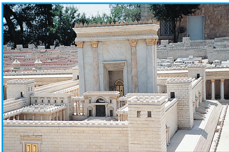
A scale model of the Jerusalem Temple in Jesus' time.

Luke, the writer and proclaimer of Jesus' message for the time between Jesus' two comings, insists Christians can face terrifying events. Faith is not certainty. But it is trust that no other than Jesus, who passed through death to life, offers words of eternal life. Faith in