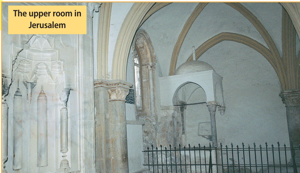
The upper room in Jerusalem

QUESTIONER 3: On all other nights we talk about many things. Why on this night do we remember the Passover?