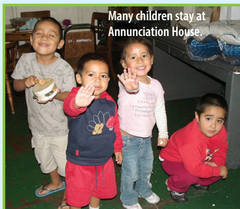
Many children stay at Annunciation House.

I have learned to ask myself, “What am I doing to ensure that my neighbors’ voices are heard?”