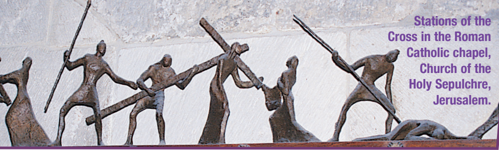
Stations of the Cross in the Roman Catholic chapel, Church of the Holy Sepulchre, Jerusalem.

what will happen. In Luke’s account Jesus takes his place at the last supper table and prophesies, “I have greatly desired to eat this Passover with you before I suffer. I tell you, I will not eat again until it is fulfilled in the kingdom of God” (22:18).