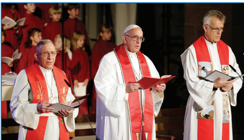
Pope Francis commemorated the 500th anniversary of the Reformation in a liturgy in Sweden with leaders of the Lutheran World Federation.

The dictators disappeared thousands of those who worked with people in the barrios . The word disappeared refers to people tortured and killed , never found or accounted for. This era in Argentina's history is called the Dirty War. It is the era when the Mothers and Grandmothers of the Disappeared begin standing in the Plaza de Mayo in Buenos Aires to protest the loss of their children, an action they have done for decades.