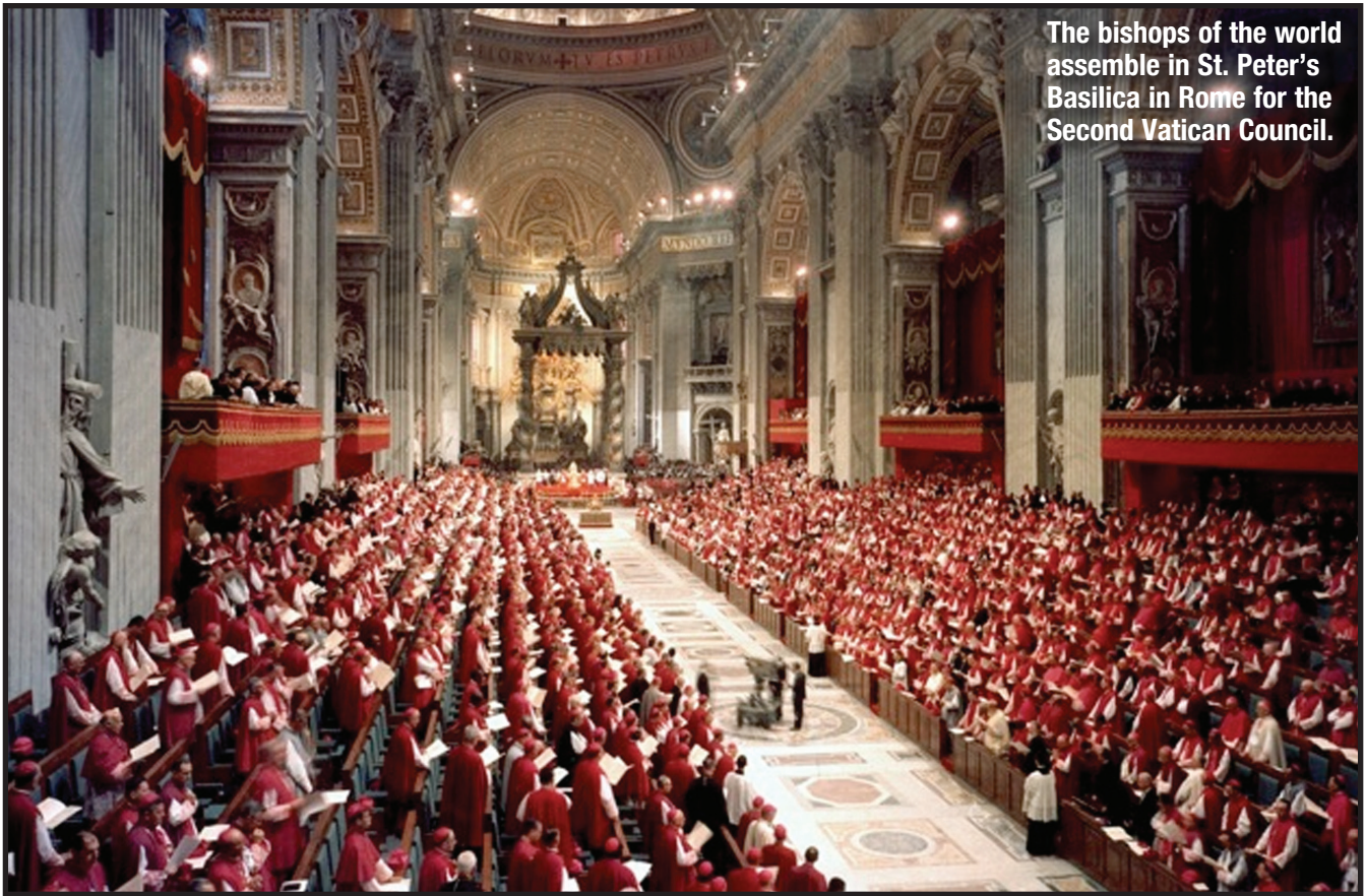
The bishops of the world assemble in St. Peter's Basilica in Rome for the Second Vatican Council.

T he bishops of the Council observed, "The hungry nations cry out to their affluent neighbors; women claim parity with men in fact as well as of right, where they have not obtained it; laborers and agricultural workers insist not just on the necessities of life but also on the opportunity to develop by their labor their personal talents and to play their due role in organizing economic, social, political, and cultural life ( Gaudium et Spes #9).