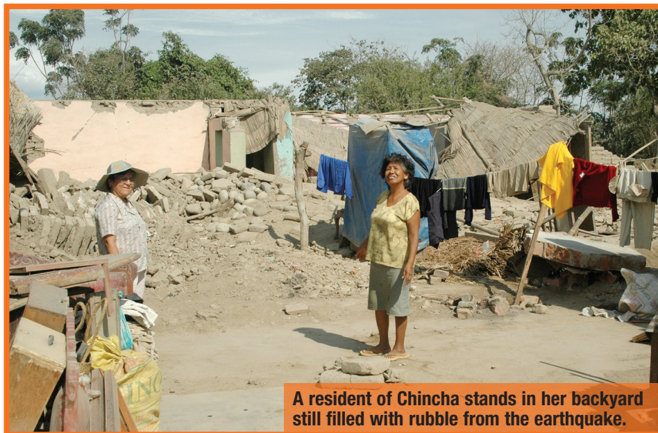
A resident of Chincha stands in her backyard still filled with rubble from the earthquake.

In September, as the school year started at Opeongo High School in Douglas, Ontario, our Interact Club went into action. Affiliated with the