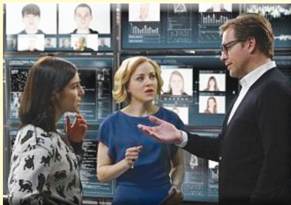
Dr. Bull is a TV series that features a psychologist whose business is selecting sympathetic jurors.

● What successes or frustrations have you experienced in seeking the truth in situations?