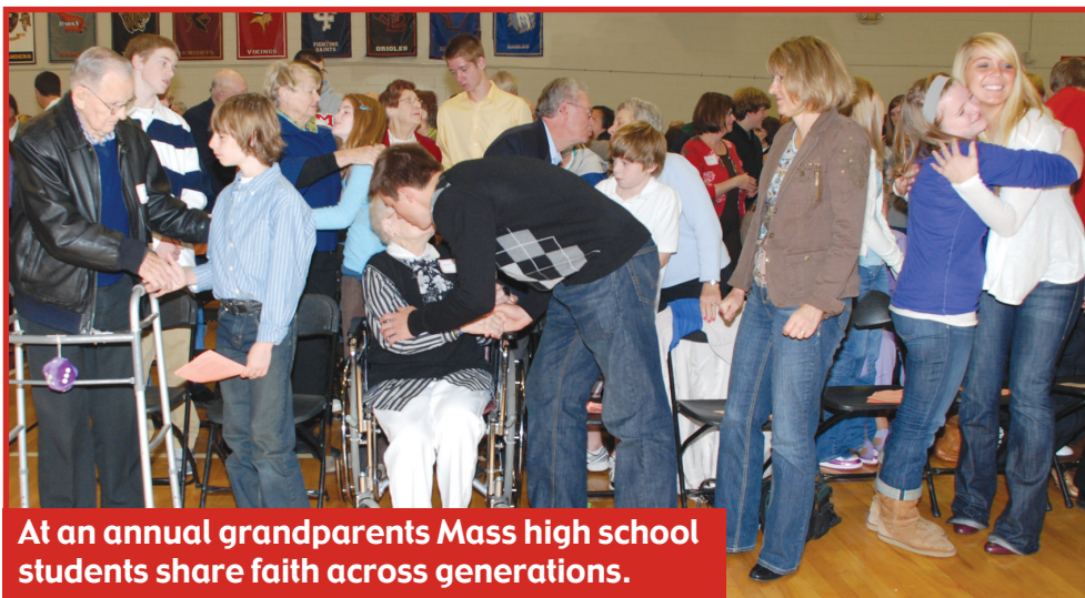
At an annual grandparents Mass high school students share faith across generations.

QUESTIONS 1 When and how have you experienced being part of something bigger than yourself? 2 How is expressing one's inner spirit also an experience of God? 3 How is your relationship with God like the author's in Keeping Faith? 4 What is an experience that has tested your faith? 5 Why is even a little faith enough? 6 What are the everyday duties of Christians?