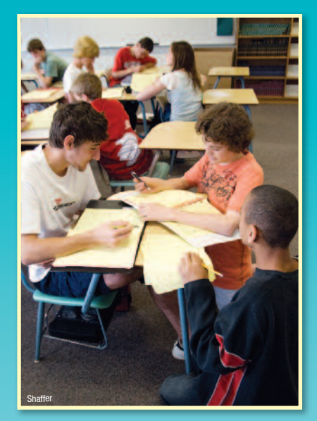
♦ What is an insight your classmates or family have appreciated you sharing?